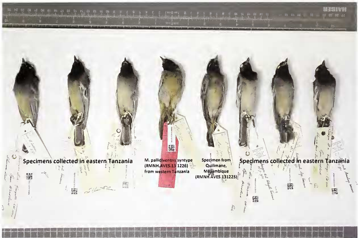
Figure 4. Rufous-bellied Tit Melaniparus rufiventris pallidiventris syntype at Naturalis Leiden compared to other M. r. pallidiventris skins from eastern Tanzania

(2) Of the west Tanzanian specimens, the three syntypes collected by Böhm (the southernmost of the western specimens) exhibit the darkest belly, intermediate between east Tanzanian pallidiventris and Zambian masukuensis . The two northernmost specimens (ZMUC 75.614, ZMB 2000/2138) are paler on the belly, similar to eastern pallidiventris (Figs. 3–4).